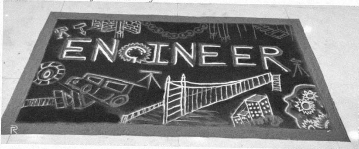
Rangoli On Entrance

8.Event photos which must include photos of event conduction and valedictory ceremony.