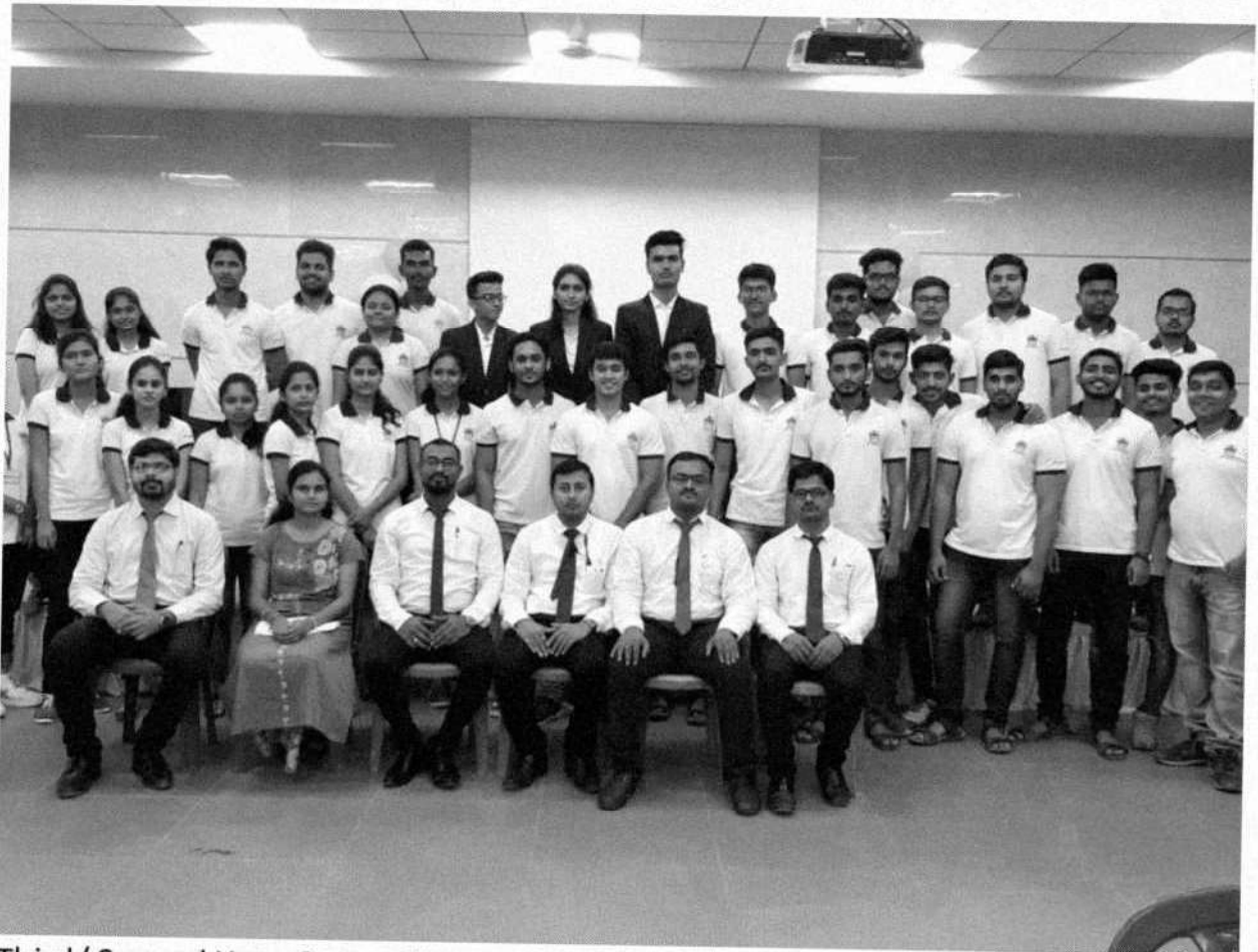
Third/ Second Year Group Picture