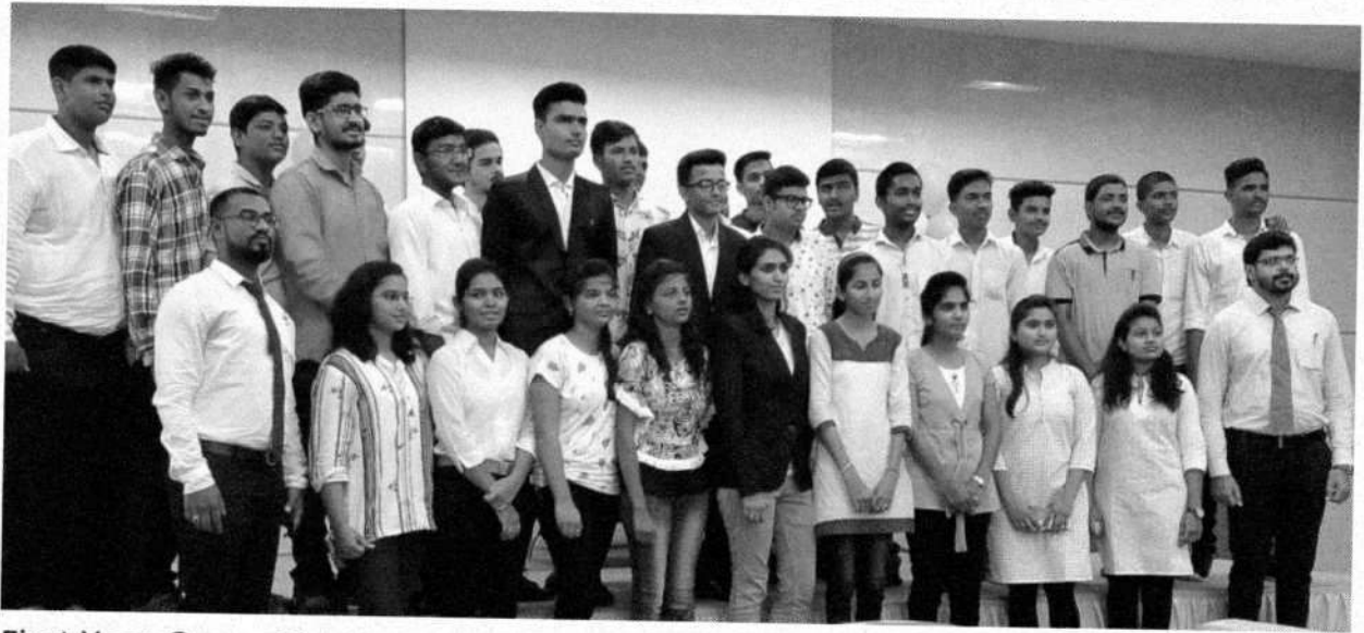
First Year Group Picture